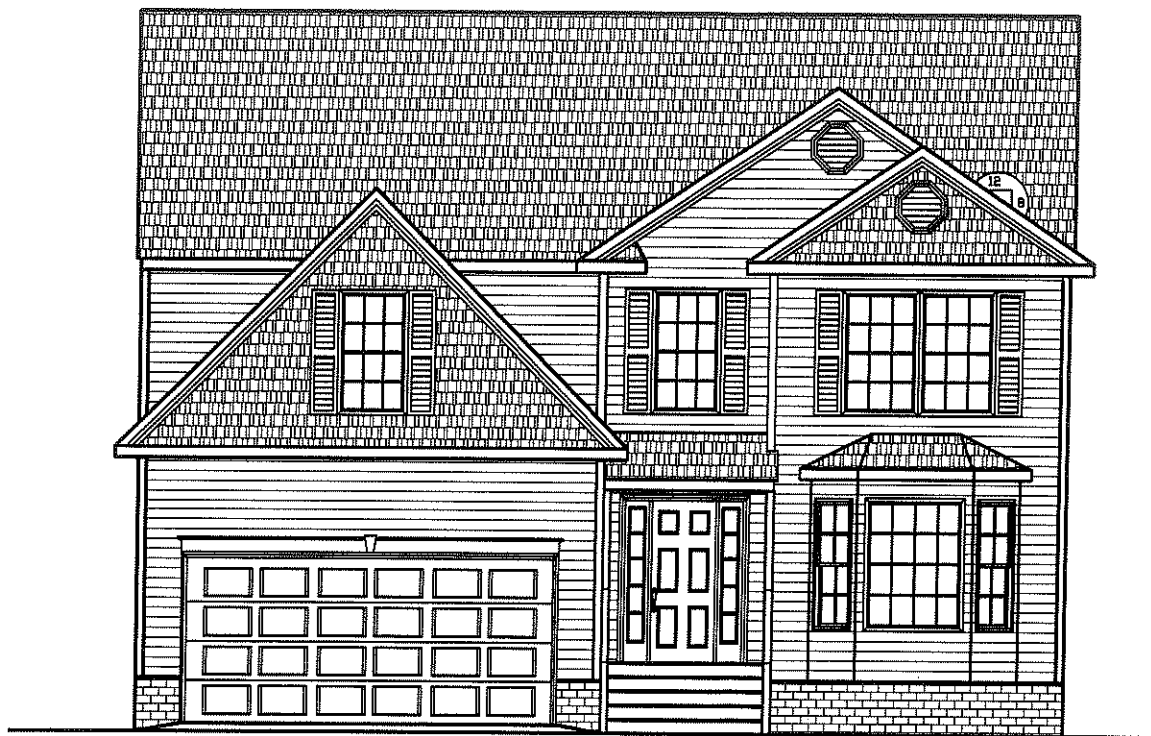
THE BAYLOR FRONT ELEVATION "A"